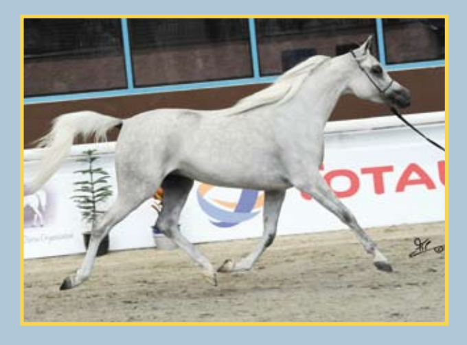
STHATCHIA AT STHAQAB (Ansata Selman x Amirat Al Shaqab)