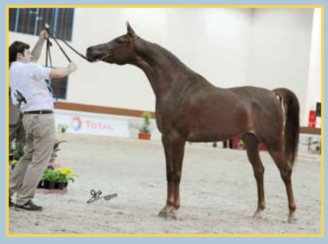
THUBAH AL SHAQAB (Hadban Al Shaqab x Sultana Al Shaqab) Breeder/Owner: Al Shaqab/Qatar